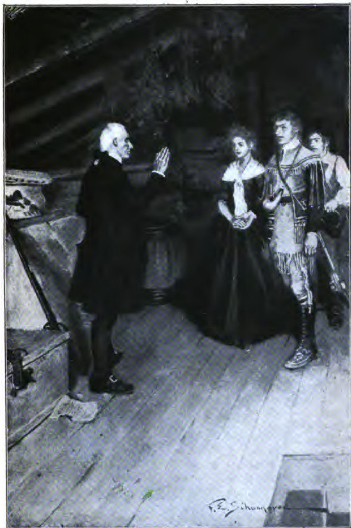
"AND SO WE WERE WEDDED"